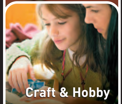
Craft & Hobby