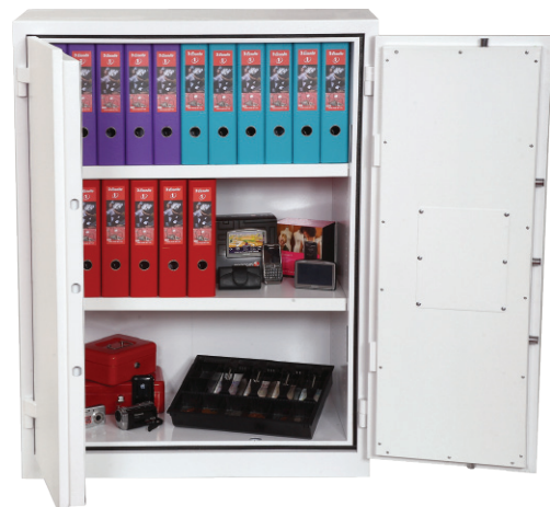
Fire Ranger FS1512K