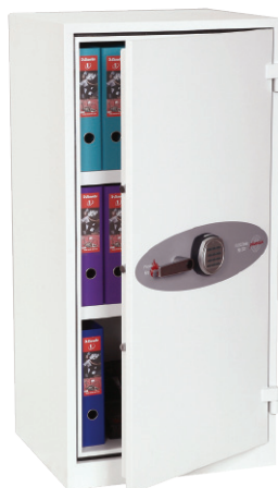
Fire Ranger FS1511E

Optional Extras Available Height adjustable shelves Suspended filing cradles Pull out lateral filing frame Telescopic shelves Cut Key (only available at time of order) Fingerprint Lock Data Protection Insert Changeable Keylock Secu B dual control/Time delay electronic lock