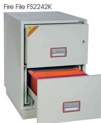
Fire File FS2242K