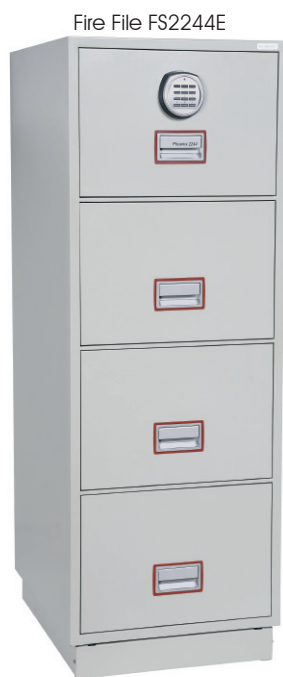
Fire File FS2244E