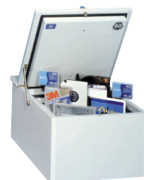
Data protection Insert FSDPI08

Optional Extras Available Key lock on each drawer REDL2 Electronic Lock & Key Lock Fingerprint lock Data Protection Insert Safe Alarm